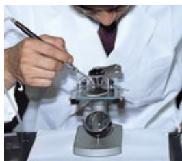
移动微小零件 Moving tiny parts