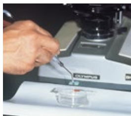
移送不平整零件 Transferring uneven parts

适用于移动IC和LSI等电子部件。 也适用于手表等精密微型零件、化学品和其他小零件。 Most suitable for handling electronic parts such as ICs and LSIs. Also precise micro parts such as watches, chemicals and other small parts.