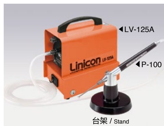
台架 / Stand